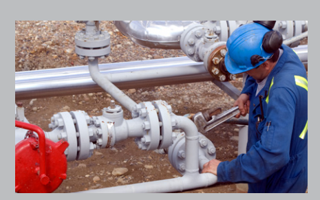
Pressure vessels such as pipelines can be filled during leak testing with water treated by AxxaVis<sup>™</sup> HST-10 to prevent rust and scale caused by ionic contaminants.